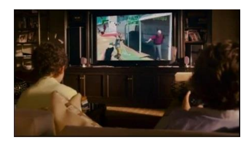
Figure 2 Example 5: Scene with Boys Playing a Video Game

shows that the dubbing was done by non-experts. However, in order to compensate for the loss, the voice-actors produce the relevant sounds themselves, as is shown in example 5 (Figure 2).