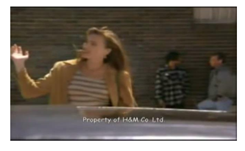
Figure 1 Example 3: Screen Shot from Dumb and Dumber (1994)

The analysis revealed that lip synchrony was hardly ever preserved, but even in professional dubbings strict lip synchrony is not always achieved either. However, kinetic synchrony and isochrony were preserved in most cases not perfectly but acceptable. In one of the clips in the sample, a scene from the movie Dumb and Dumber (1994), a young lady is using hand movements to give directions (see Figure 1) whereas in the dubbed version the gesture is verbalized (see Table 3).