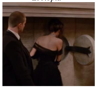
Figure 5 An Original Scene from Tourist