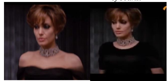
Figure 7 An Original Scene from Tourist