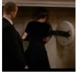
Figure 6 The Manipulated Scene in the Dubbed Version of Tourist