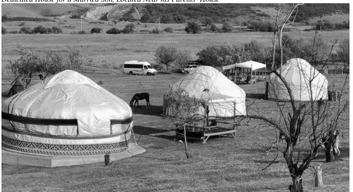
Figure 4 Dedicated House for a Married Son, Located Near his Parents' House