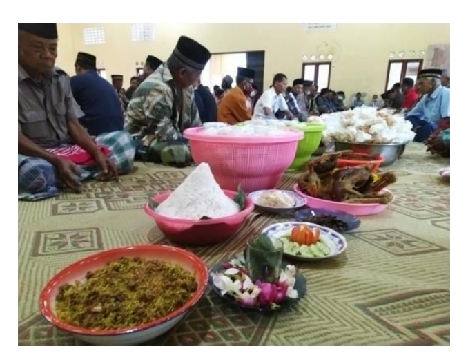
Figure 1 Selamatan Procession