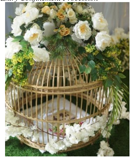
Figure 7 Entry Confinement Procession