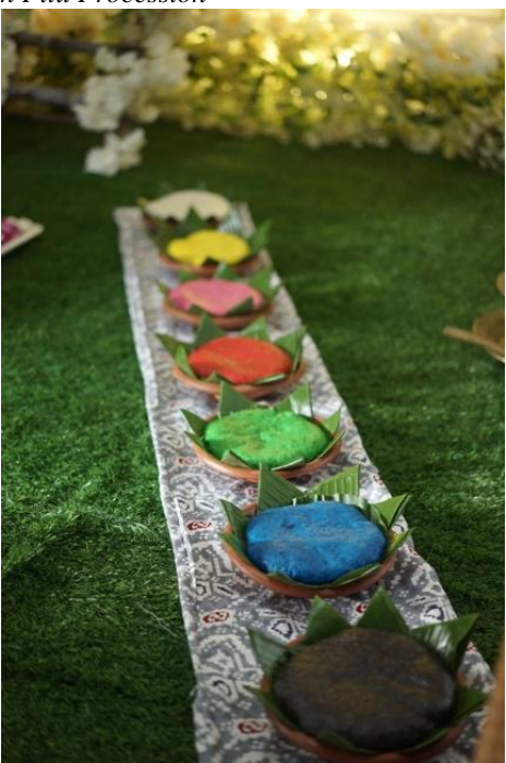
Figure 4 Tapak Jadah Pitu Procession

The ceremonial procession involves stepping on a platform adorned with seven distinct colors. Jadah ( uli ), a mixture of sticky rice and grated coconut, undergoes a meticulous preparation process involving cooking and grinding until achieving a clay-like consistency. Subsequently, the mixture is arranged in a clay plate, segregating each color, each representing one of the seven colors: black, blue, green, red, pink, yellow, and white. Parents play a central role in guiding the child through this symbolic journey, starting from the black and culminating at the white jadah .