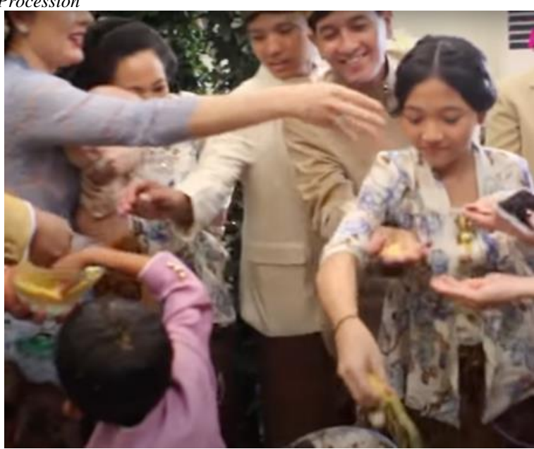
Figure 8 Spreading Udhik-Udhik Procession