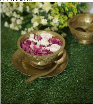
Figure 3 Wijikan Procession