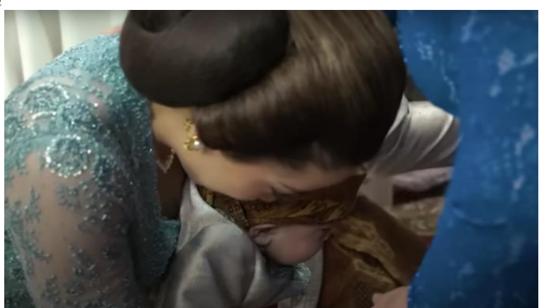
Figure 2 Sungkem Procession