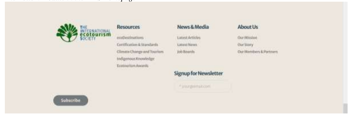
Figure 4 The Bottom Module in the TIES Homepage

before on the top module, like "About Us" and the rest, like "Resources", "News", and "Media", is new. These bottoms are represented through using a bold font that enthralls the viewers and attracts their attention. Again, using the curvy rectangle "Subscribe" adds salience and encourages viewers to be a part of TIES society. Likewise, the first module's design is repeated here, and this is another kind of salience. Employing angular shapes like the green circle and the grey rectangle alludes to the advancement of technology, which threatens the ecological system with all its components.